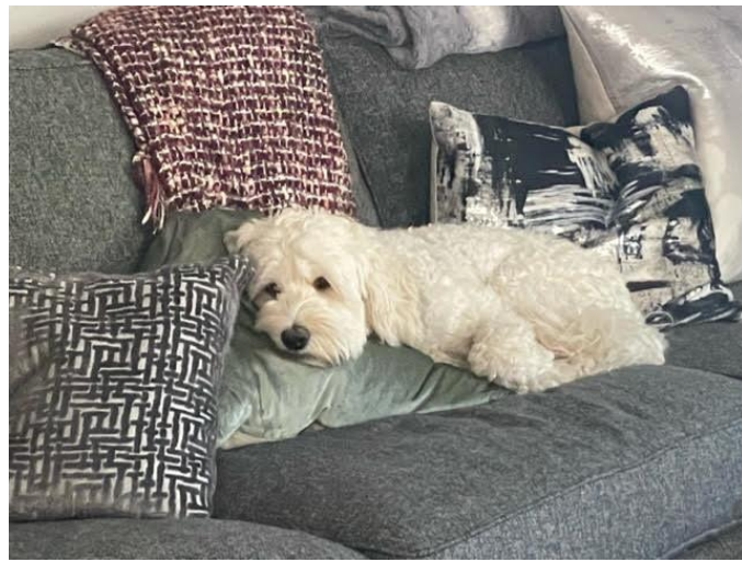
Mini Baby Minnie