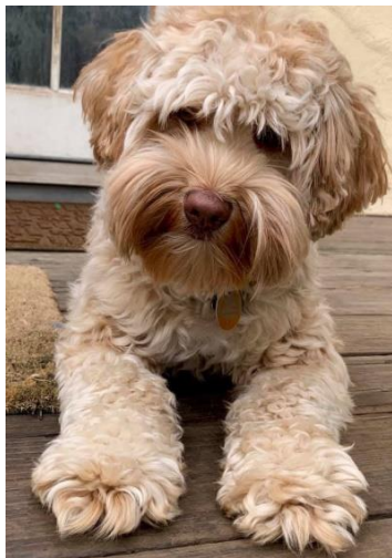
Past Hubble Pup