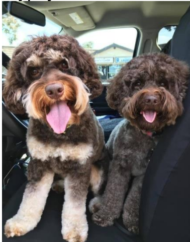
Gypsy and mama Oona

We anticipate offspring in a range of sizes from 25-35 lbs. We will have a better idea about projected relative sizes of individual puppies once they reach 6-7 weeks of age. Due date around January 23rd, 2020, going home March 19th. We are accepting 3 Reservations, initially, plus waitlist. (I hope to retain a female for my program and will be seeking a Foster-Guardian Family.) Update: Gypsy appears to be pregnant.