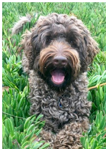
Our 2019 Calendar Girl