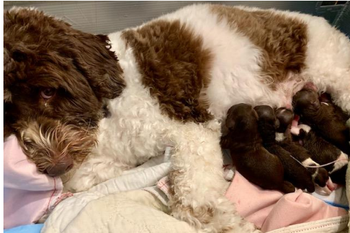
With her BFF “Biscuit”